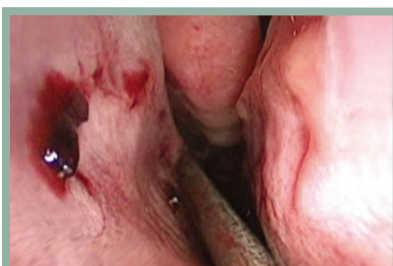
Implants viewed immediately after implantation