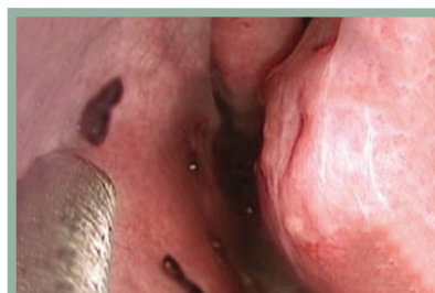
One week postoperative view of implants