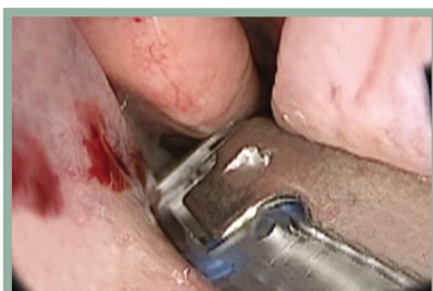
Stapling the septal flaps

The following endoscopic images demonstrate use of the ENTact septal stapler.