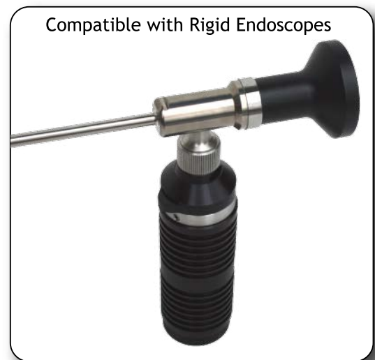
Compatible with Rigid Endoscopes