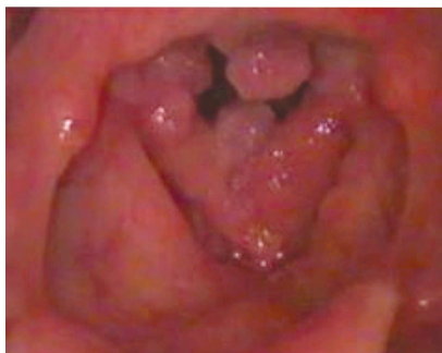
Before COBLATION® technology treatment