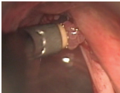
Pulling lesion away from the wall using Wand suction

Note: Use caution and ablate in short bursts (0.25 second to 0.5 second) using quick on and off depressions of the yellow Ablate foot pedal.