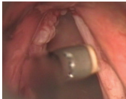
Wand in contact with sessile papilloma lesion