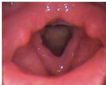
After COBLATION technology treatment