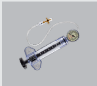
Cook Sphere® Inflation Device