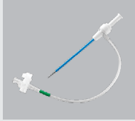
Kolenda Salivary Access Introducer Set