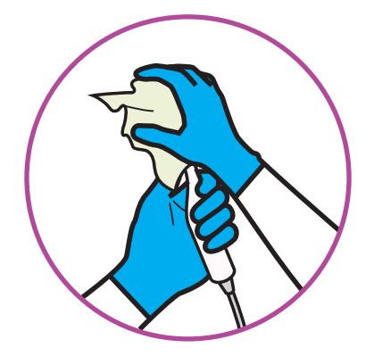
USE THE WIPE TO SPREAD THE FOAM OVER THE SURFACE OF THE ULTRASOUND PROBE AND ASSOCIATED PARTS. ENSURE ALL AREAS ARE COVERED.