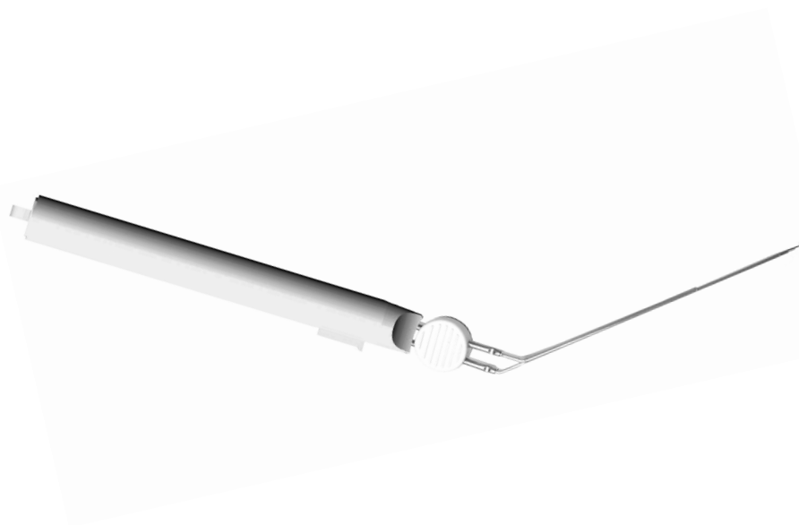
Micro Heating Element